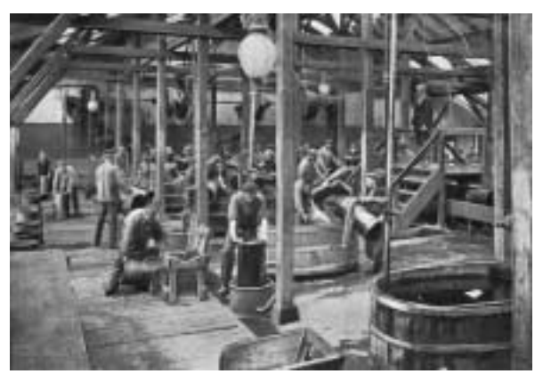
Photo 1 . The latrine barrels are being emptied. Kløvermarken in Amager, 1901.