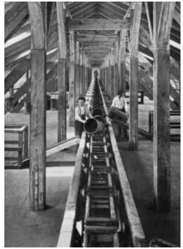
Photo 3 . The latrine barrels have been cleaned and are ready for reuse. Kløvermarken in Amager, 1901.

eligible for the jury's approval in 1851. Paving inspector Lindberg had submitted a sophisticated forward-looking plan for a separate sewer system with lavatories. His plan was selected as a basis and upgraded with the proposal for a pumping station and outlets to the sea alone, which had been submitted by the Frenchman, Mr Marillier. Disagreement on the future sewer system delayed the decision for several years and made it impossible to install the sewer system at the same time as the other systems. The prefect, who turned out to have the most clout, was of the opinion that the night soil should continue to be collected, carted out and used as fertilizer and that consequently the installation of lavatories could not be allowed.