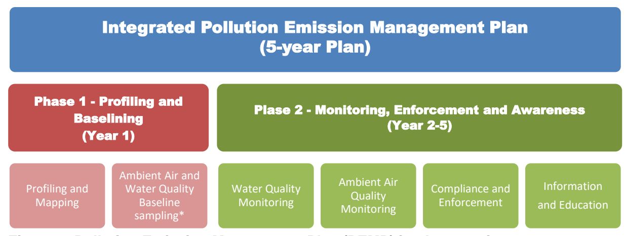
Figure 1. Pollution Emission Management Plan (PEMP) implementation structure

The PEMP implementation structure is presented in Figure 1 while the description of the individual programs and other information is presented in succeeding section.