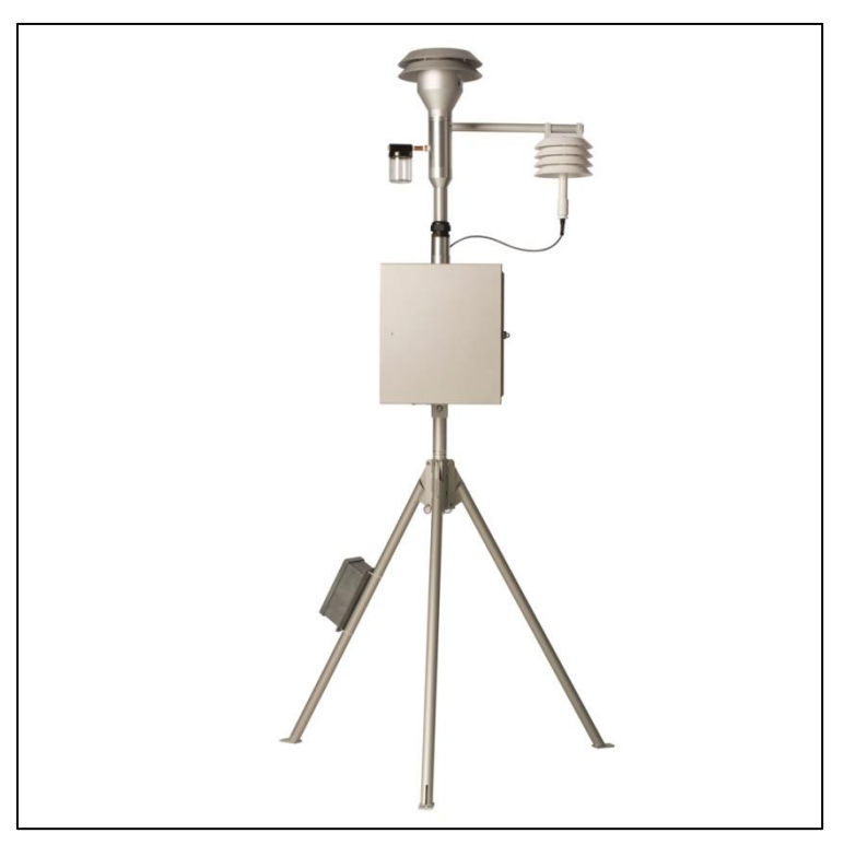
Figure 2. E-BAM instrument

Attenuation Mass Monitor or E-BAM ( Figure 2 ). It is a portable and battery device that provides real-time beta gauge comparable to U.S. EPA methods for PM10 particulate measurements. Other parameters for monitoring are dust particulates and temperature.