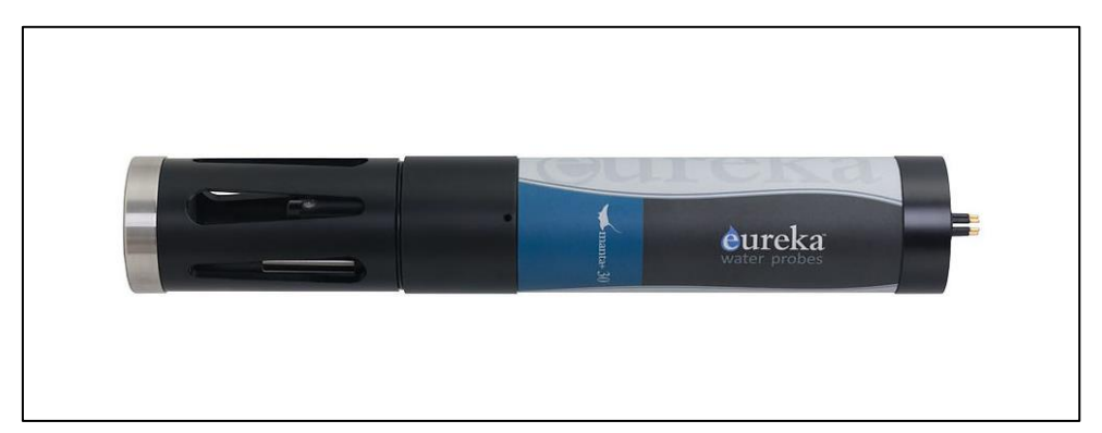
Figure 4. Eureka water probe Manta+30

Manta+30 model comes standard with wipered turbidity, temperature, pH, conductivity, dissolved oxygen, and optional ORP and depth sensors.